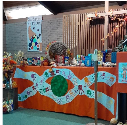
World Food Sunday