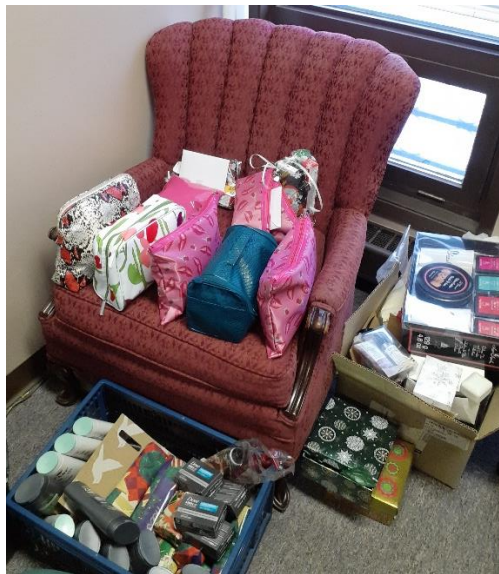
Items for our Christmas Hampers