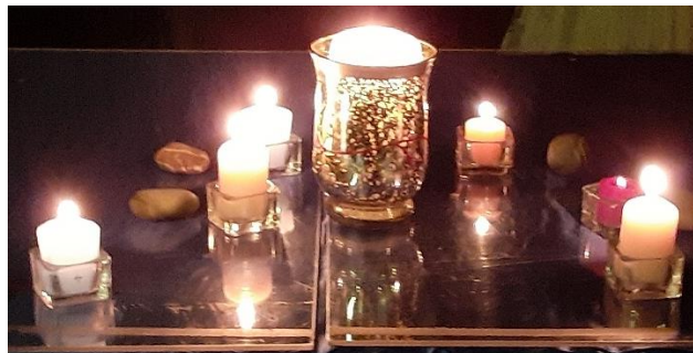
The Longest Night