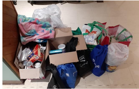
The Sparks and Embers "Warbled in Windsor Park" And brought goodies for our Christmas Hampers