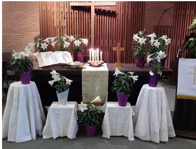
Our Beautiful Easter Lilies