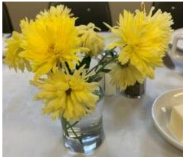
More U.C.W. Flowers