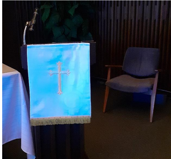
Our Empty Pulpit