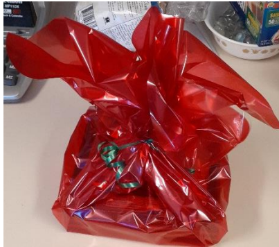
Thinking of You Basket