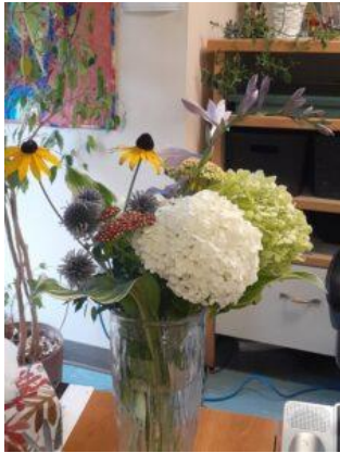
Flowers from the WPUC garden