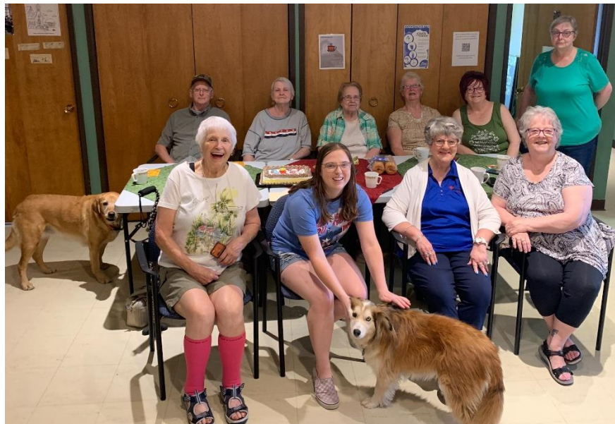
The Holy Grounds Café